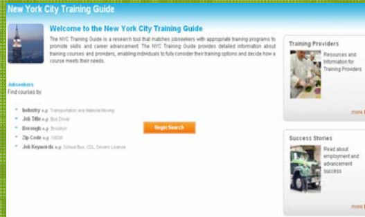
NYC Training Guide www.nyc.gov/trainingguide